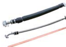
Pipe and Hose