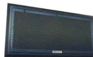
Air Return Grille